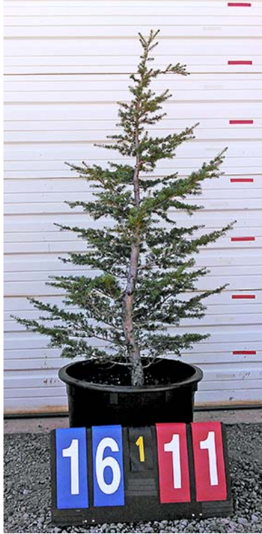
Mt. Hemlock #111 $75.00