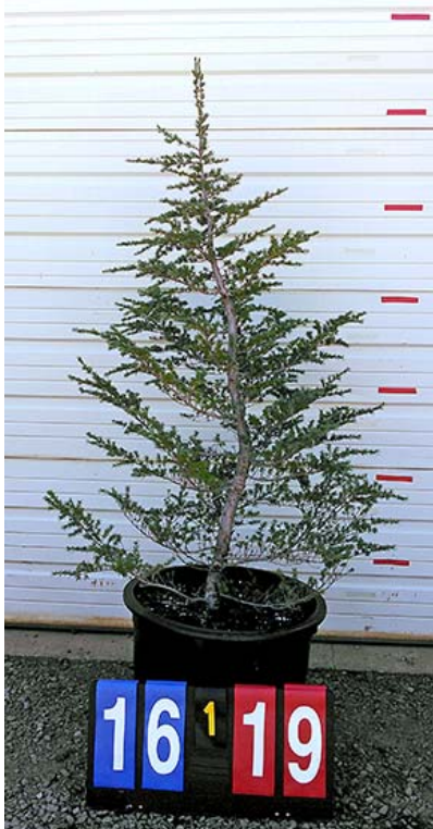
Mt. Hemlock #119 $85.00