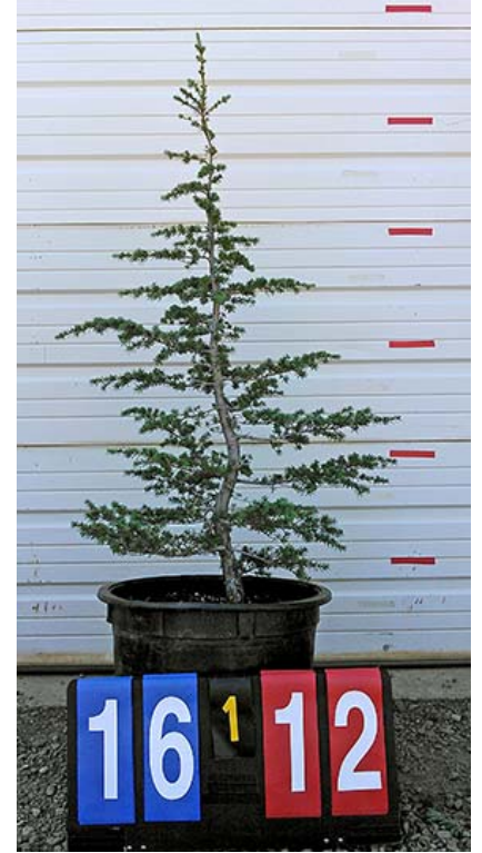
Mt. Hemlock #112 $70.00