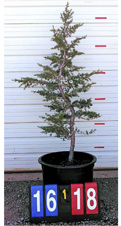
Mt. Hemlock #118 $90.00