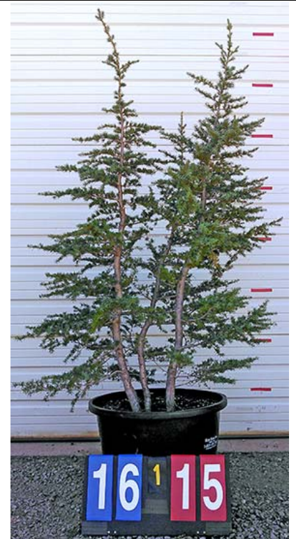
Mt. Hemlock #115 $130.00