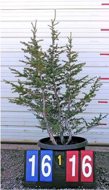
Mt. Hemlock #116 $85.00