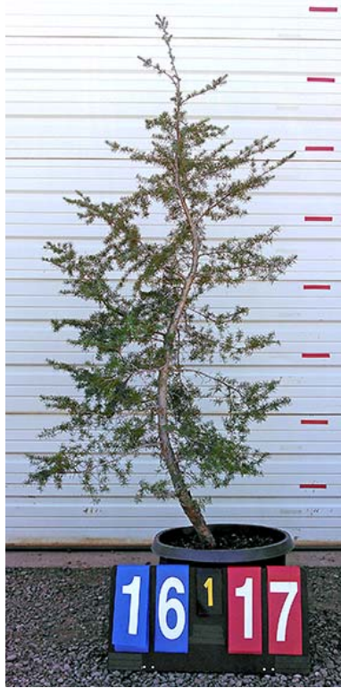
Mt. Hemlock #117 $85.00