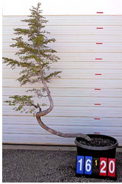
Mt. Hemlock #120 $220.00