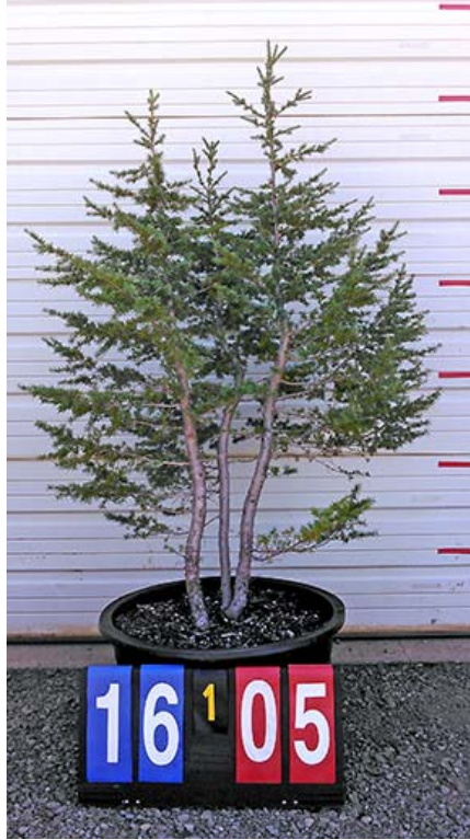
Mt. Hemlock #105 $110.50