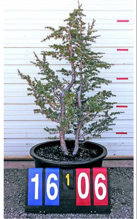
Mt. Hemlock #106 $95.00