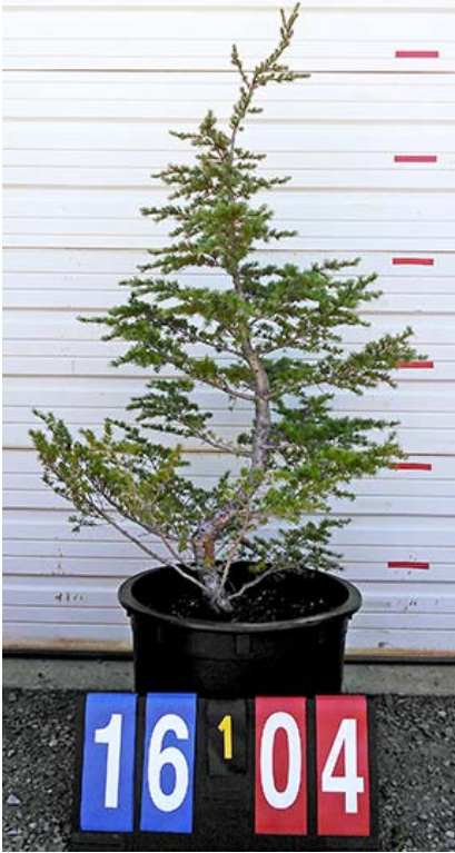
Mt. Hemlock #104 $85.00