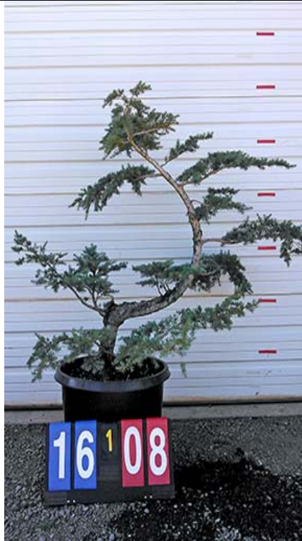
Mt. Hemlock #108 SOLD