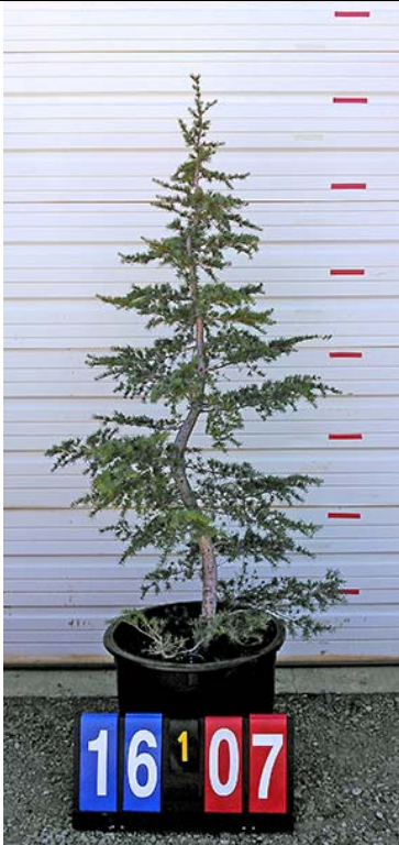
Mt. Hemlock #107 $97.50