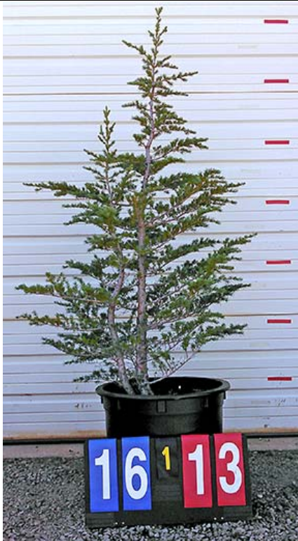
Mt. Hemlock #113 $105.00