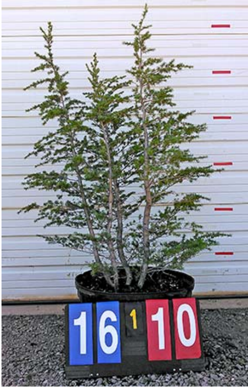
Mt. Hemlock #110 $100.00