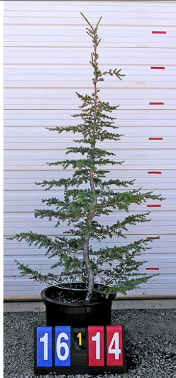
Mt. Hemlock #114 $90.00