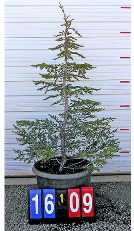
Mt. Hemlock #109 $90.00